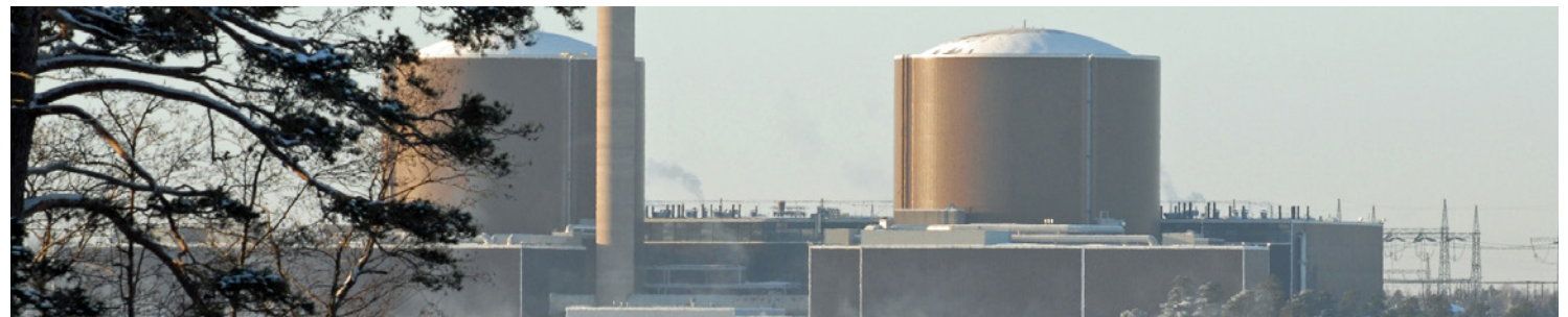
LOVIISA NUCLEAR POWER PLANT