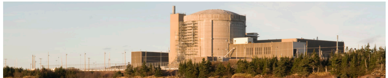
POINT LEPREAU NUCLEAR POWER PLANT