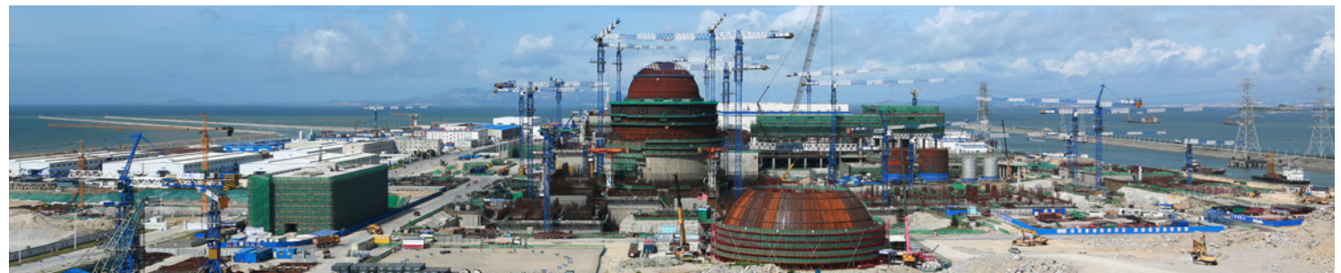
FUQING NUCLEAR POWER PLANT